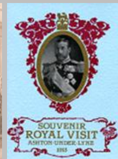
Photographs: 254 and 256 Oldham Road decorated for the Royal visit and the Ashton-under-Lyne Souvenir brochure.