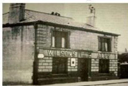
Photo: Wellington Inn 1969

A popular public house in the 1990's and early 2000's it changed ownership several times and after a spell of being vacant, the former public house was converted in 2011 and became a Tesco Express Supermarket.