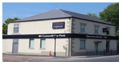
Photo: Tesco Express, located within the former Wellington Inn - 2014