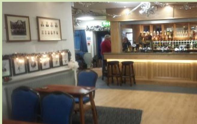
Photo: New Wood effect flooring, new carpets, new pictures.