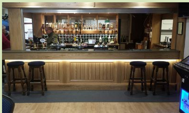
Photo: New Club Bar with light oak paneling and down lights