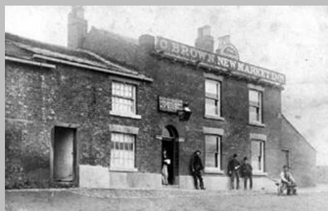
Photo: Newmarket Tavern in 1901

In 1880 it was also used as a mortuary for the District.