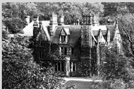
Photo: Riverside Hall in 1905

Remains of the building, including original footings can still be seen to this day, with the size of full rooms still visible.